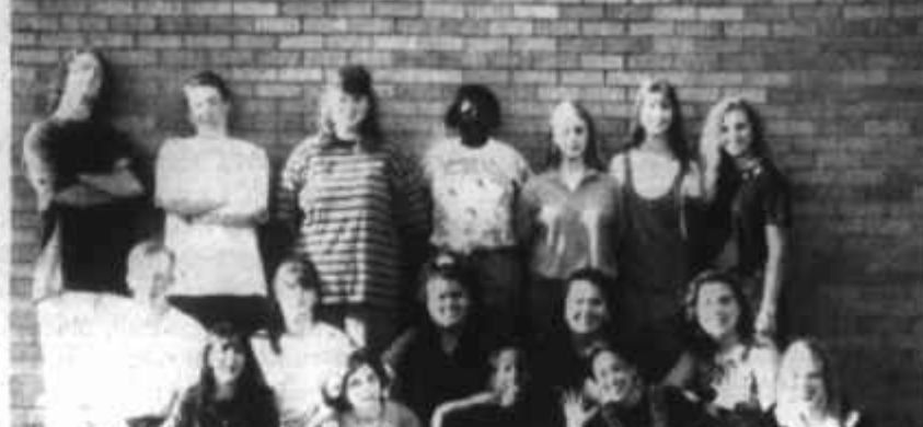
Raider Band officers